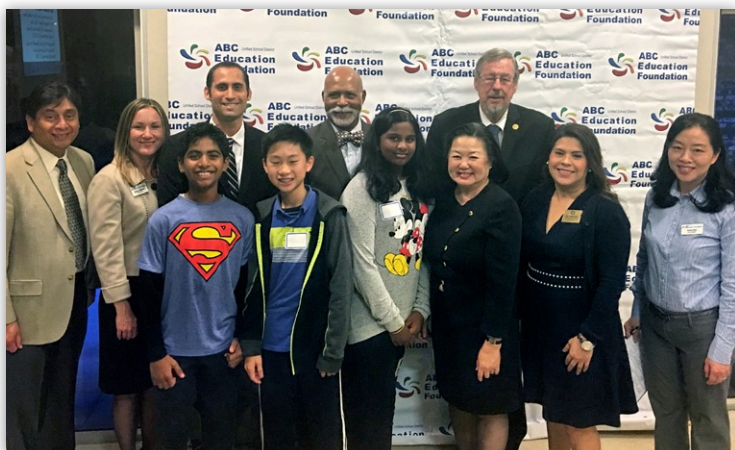
Wittmann ES received a mini-grant in the amount of $1,900 for their Robotics/Drone Racing Team