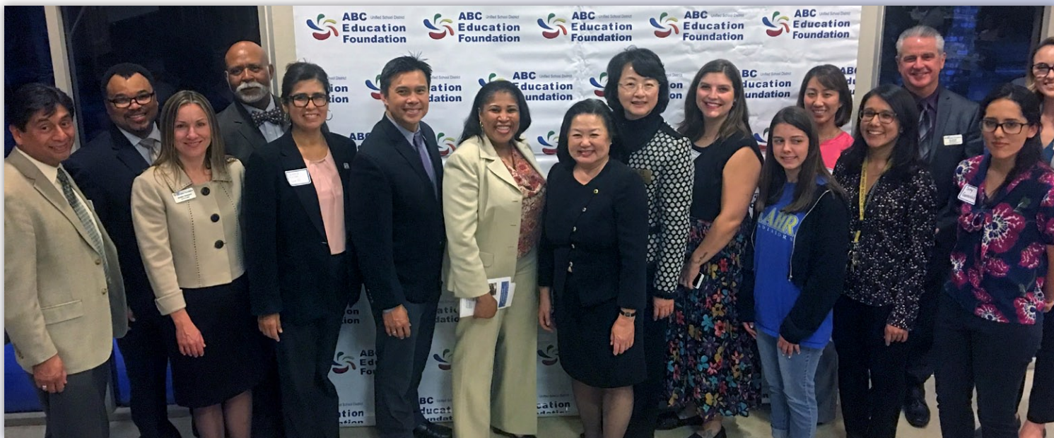
Gahr HS received six mini-grants totaling over $10,000 from the Foundation