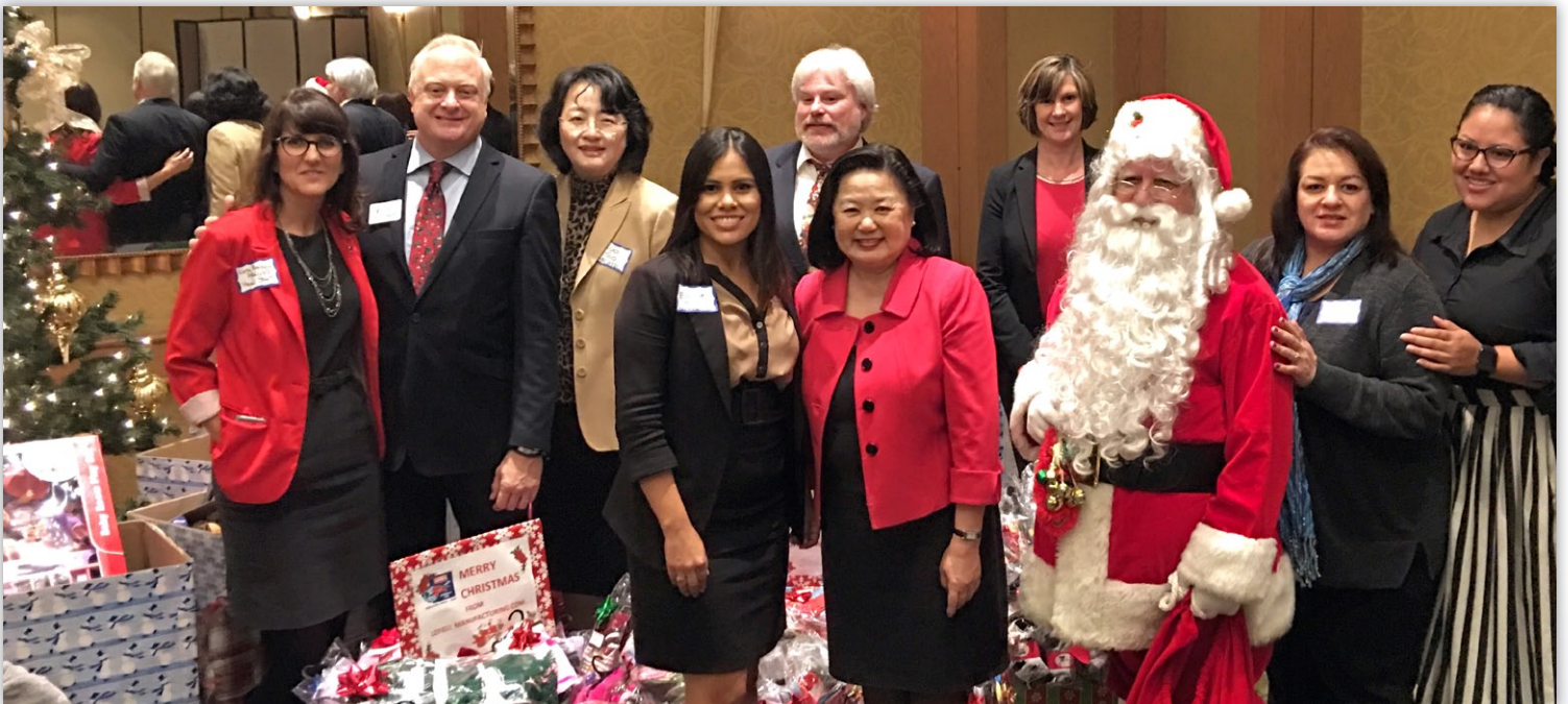
Cerritos Regional Chamber of Commerce Holiday Donations to the District's Head Start Program