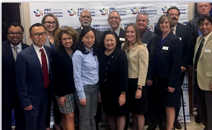
ABC Education Foundation Board of Directors