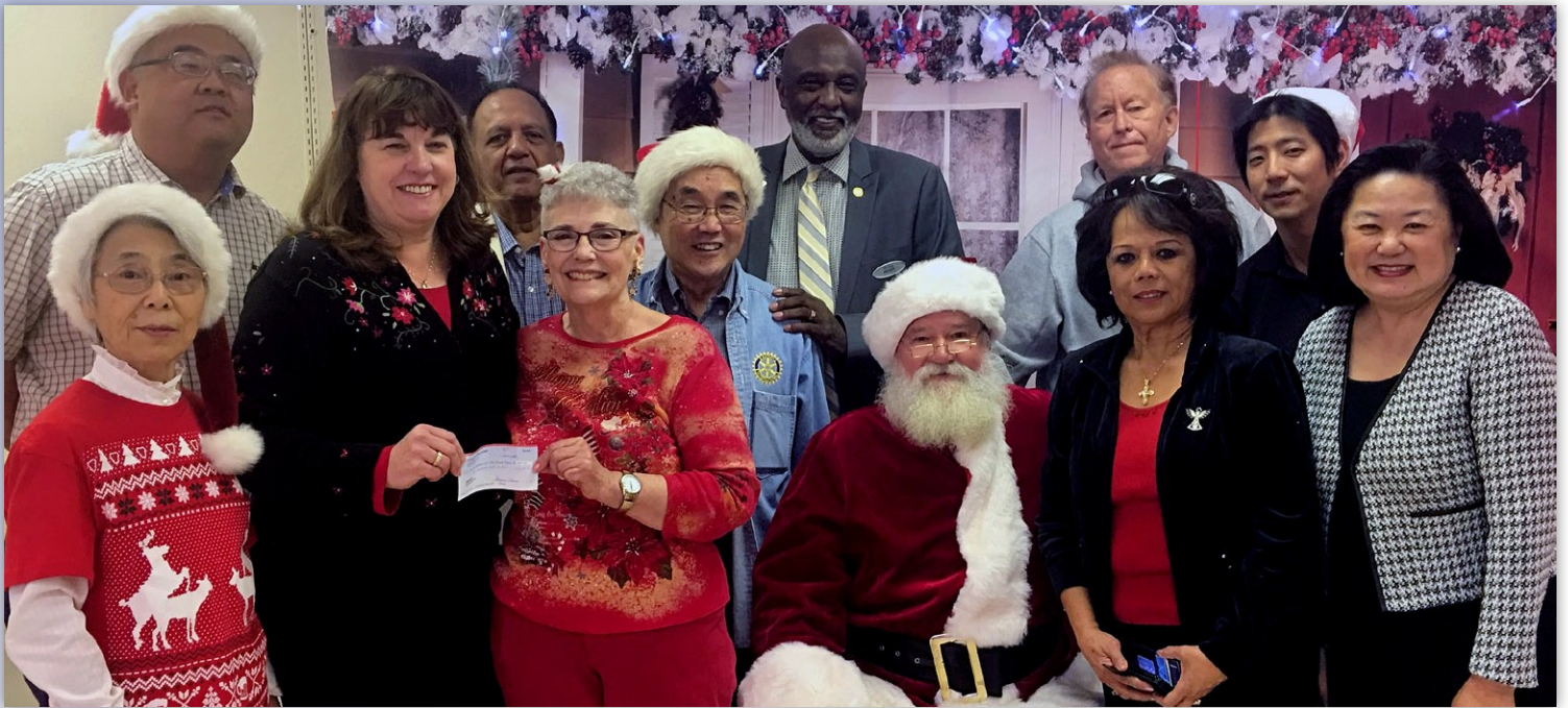
The Cerritos-Artesia Rotary Club held their Annual Holiday Luncheon supporting the Tracy Teen Parent Program