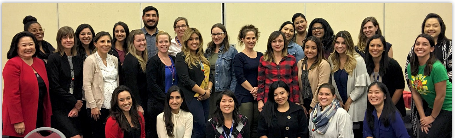
District Social Workers and Wellness Coordinators