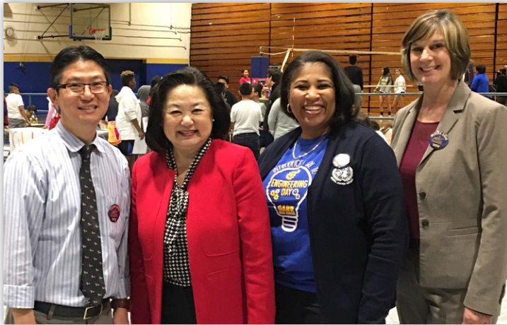
Engineering is Elementary at Gahr HS

On Tuesday, December 19, Gahr HS held their 2 nd Annual Engineering is Elementary Program for over 200 elementary students. This event showcased the importance of engineering concepts in everyday life by Gahr HS students. It was a wonderful event that also included engineers in the field speaking with the students. Gahr HS will also be hosting a similar event in the beginning of the year with middle school students. ▶