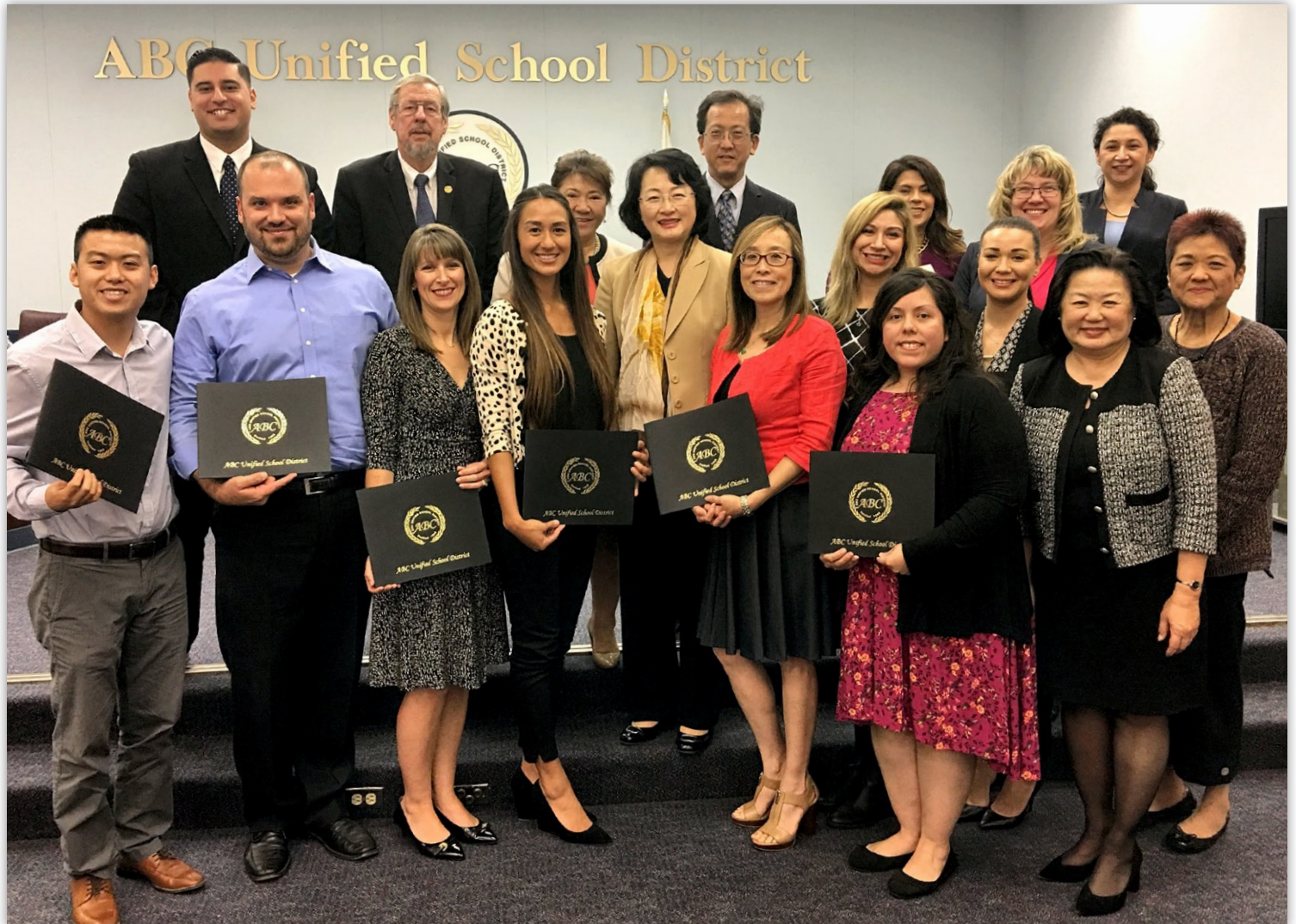
The ABC Board of Education honored teachers in the Teacher Induction Program

Congratulations to the 12 teachers who completed the two years Teacher Induction Program in ABC! Great job! ▶